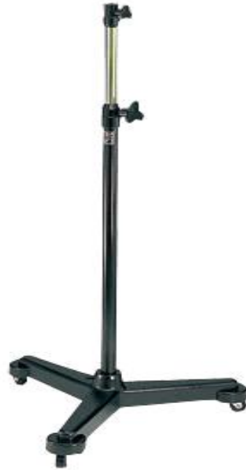
ST2C 이단 스탠드