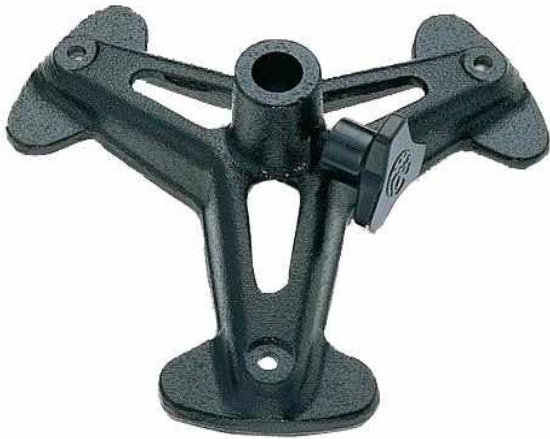
SHB-10 평면 베이스